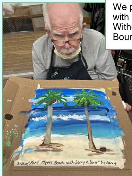
We painted with "Art Without Boundaries".