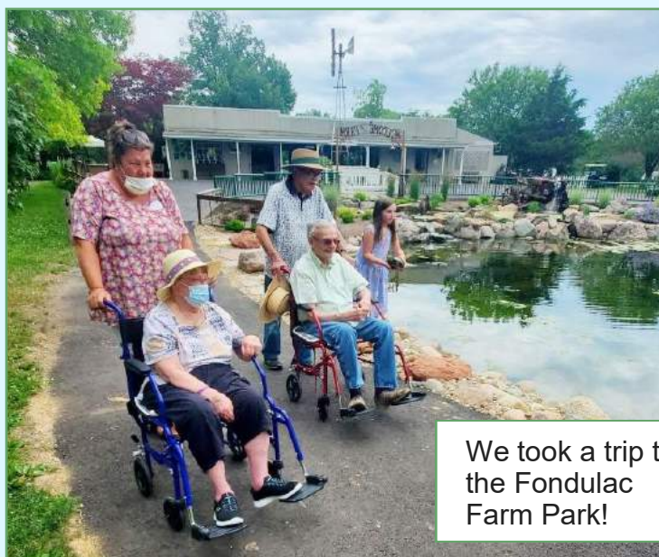
We took a trip to the Fondulac Farm Park!