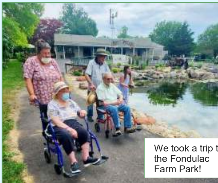
We took a trip to the Fondulac Farm Park!