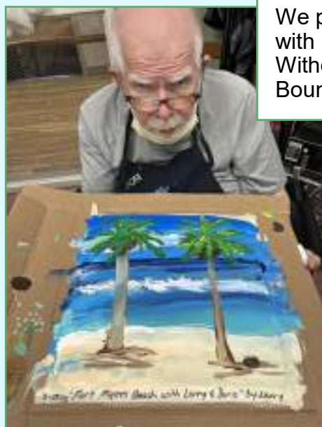
We painted with "Art Without Boundaries".