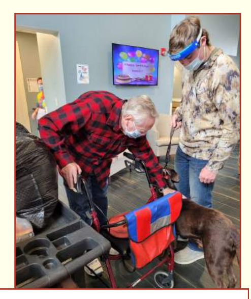
We loved having Duke the therapy dog come visit!