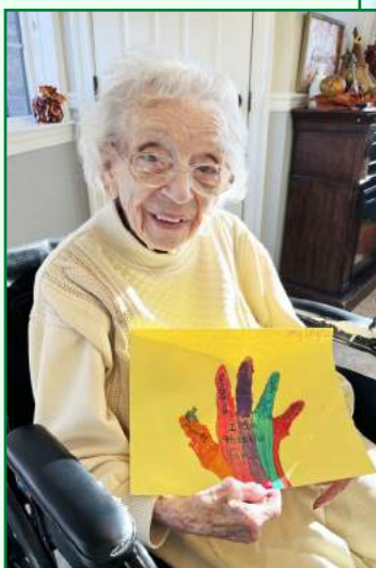
We painted turkeys & turkey feathers for Thanksgiving.