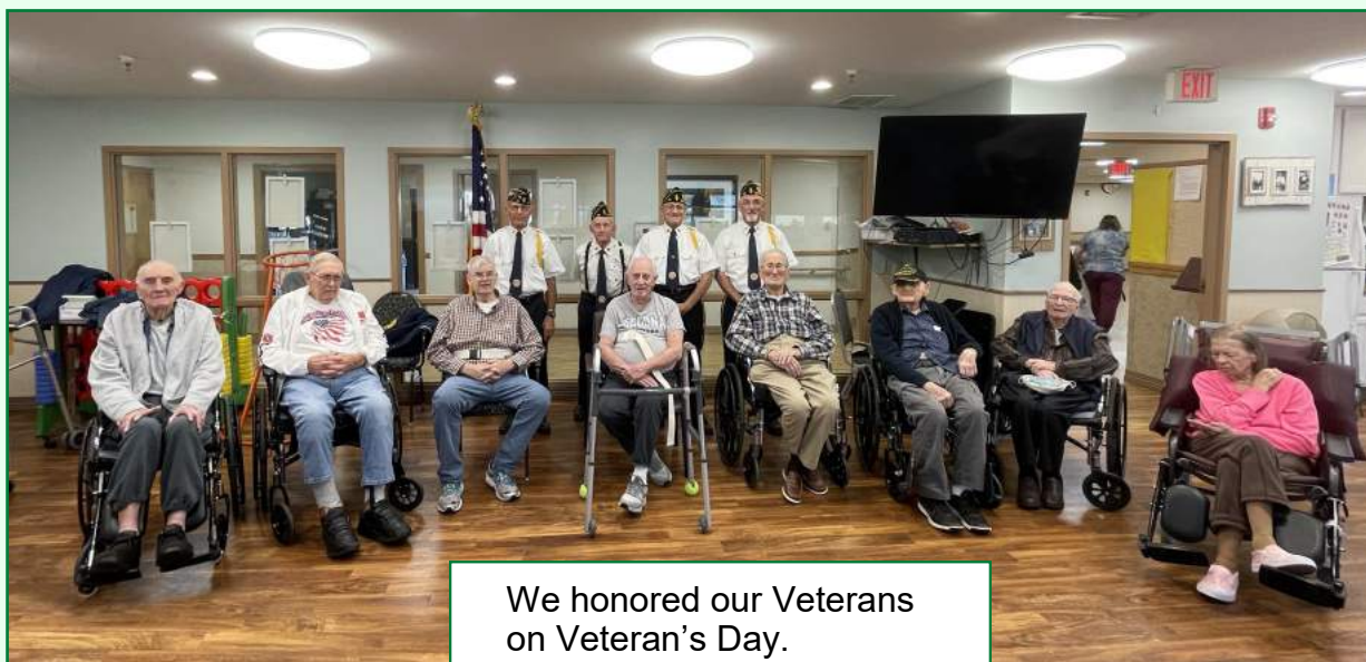
We honored our Veterans on Veteran's Day.