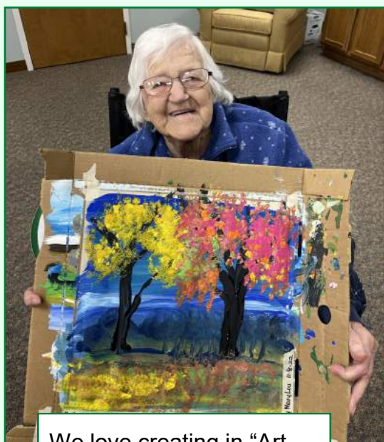
We love creating in "Art Without Boundaries" class.