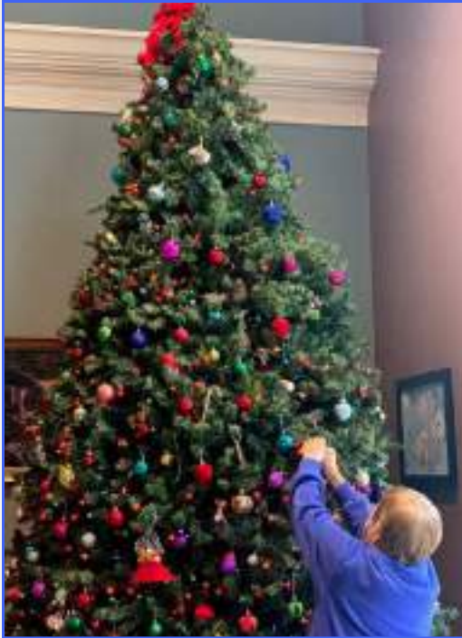
We all helped decorate our Christmas tree.