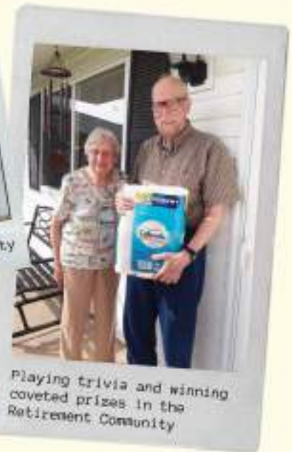
Playing trivia and winning coveted prizes in the Retirement Community