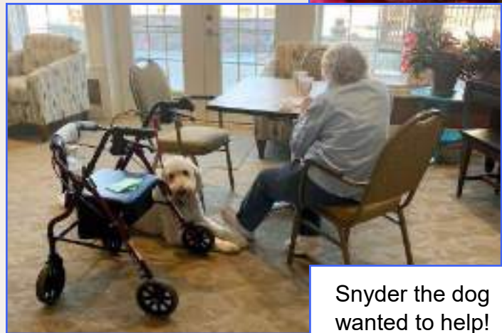
Snyder the dog wanted to help!