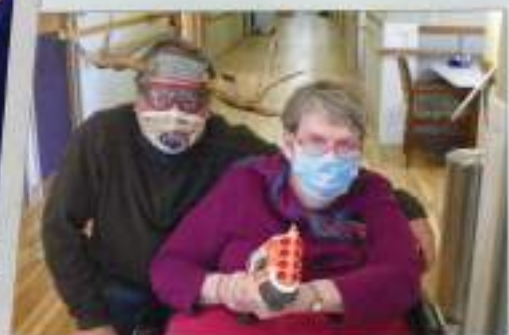
"Deer" hunting in the Health Center