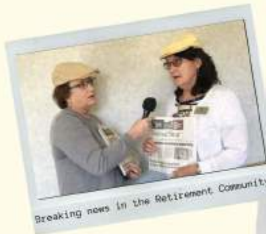
Breaking news in the Retirement Community