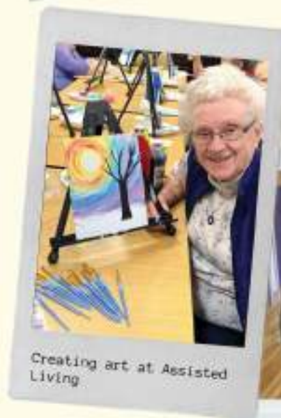
Creating art at Assisted Living