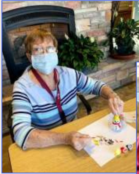
We had fun painting Christmas tree ornaments!