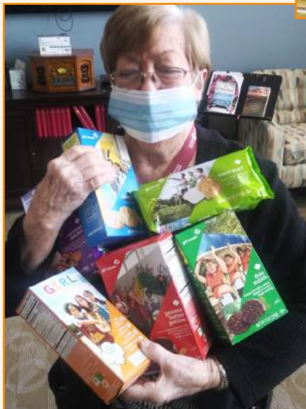
Girl Scout Cookie Day was a hit!