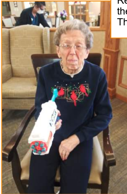
Residents in Memory Care took their shot at hitting the target. They did a great job!