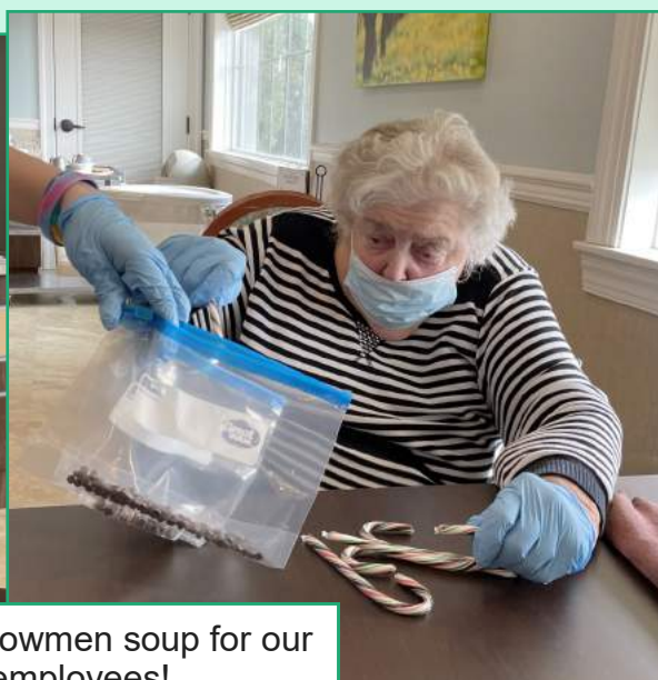
We made snowmen soup for our visitors and employees!