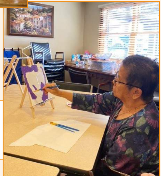
Memory Care residents had fun painting hearts for Valentine's Day.