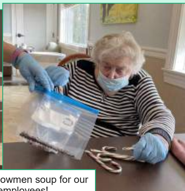
We made snowmen soup for our visitors and employees!