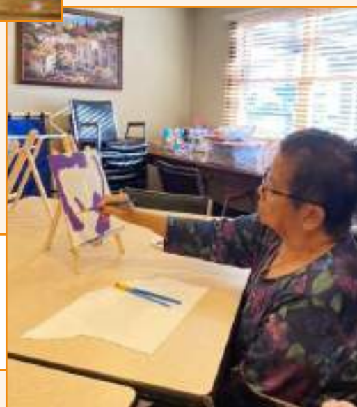
Memory Care residents had fun painting hearts for Valentine's Day.