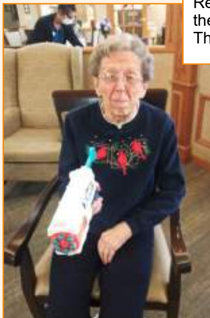
Residents in Memory Care took their shot at hitting the target. They did a great job!