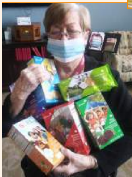
Girl Scout Cookie Day was a hit!