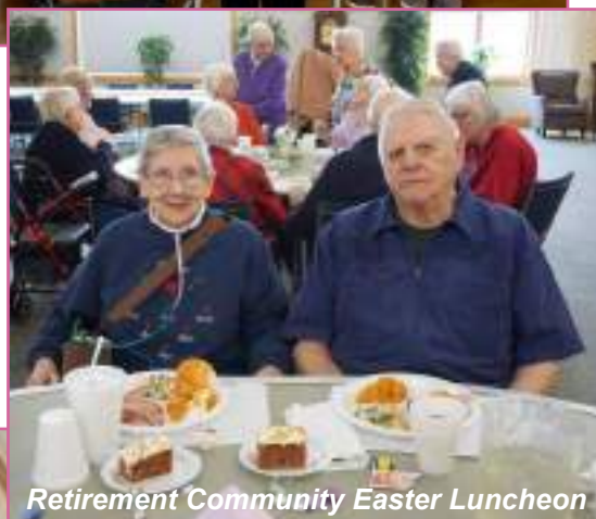
Retirement Community Easter Luncheon