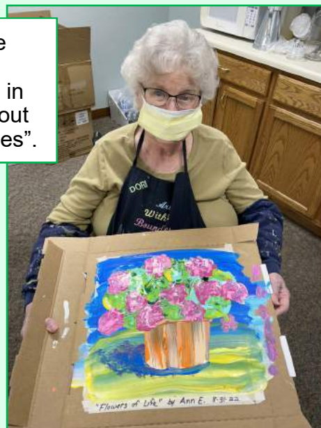
We made beautiful paintings in "Art Without Boundaries".