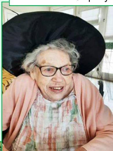
Memory Care residents had fun at our Wizard of Oz party!