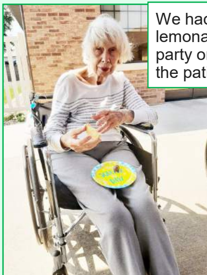
We had a lemonade party on the patio!