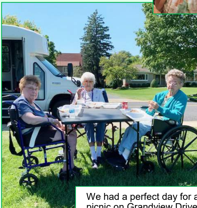
We had a perfect day for a picnic on Grandview Drive.