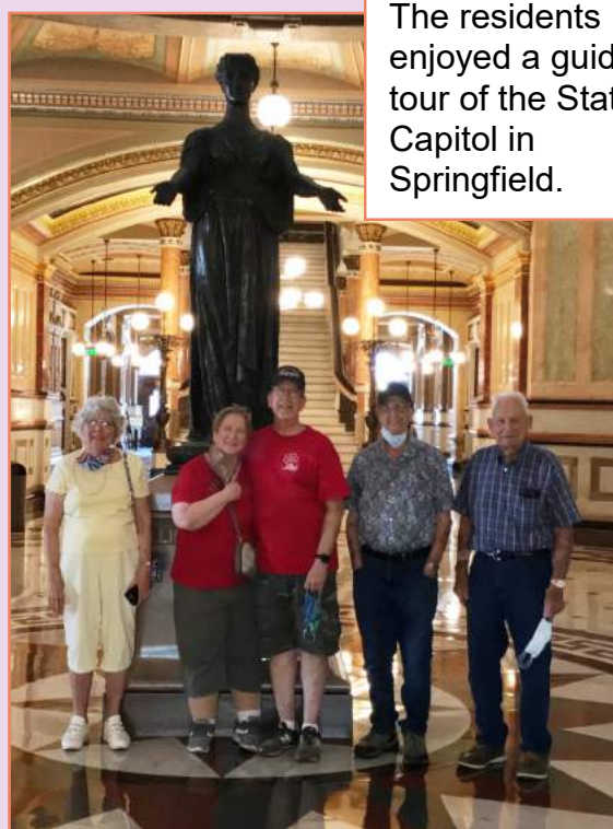
The residents enjoyed a guided tour of the State Capitol in Springfield.