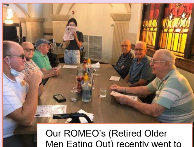
Our ROMEO's (Retired Older Men Eating Out) recently went to Obed and Isaacs for lunch.