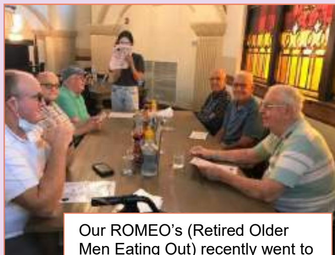
Our ROMEO's (Retired Older Men Eating Out) recently went to Obed and Isaacs for lunch.