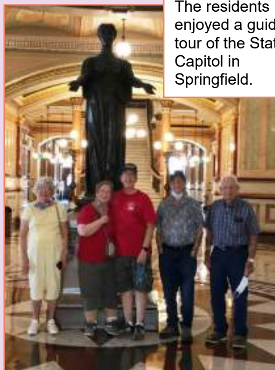
The residents enjoyed a guided tour of the State Capitol in Springfield.