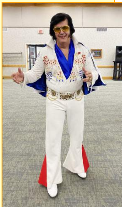
We had lots of fun during Elvis week with our Hound Dog Pool Party, learning to hula, and an Elvis Tribute Artist coming to sing for us.