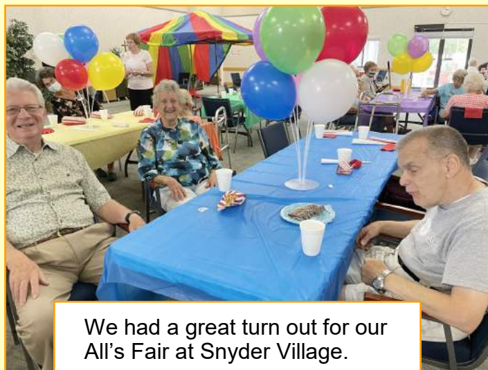
We had a great turn out for our All's Fair at Snyder Village.