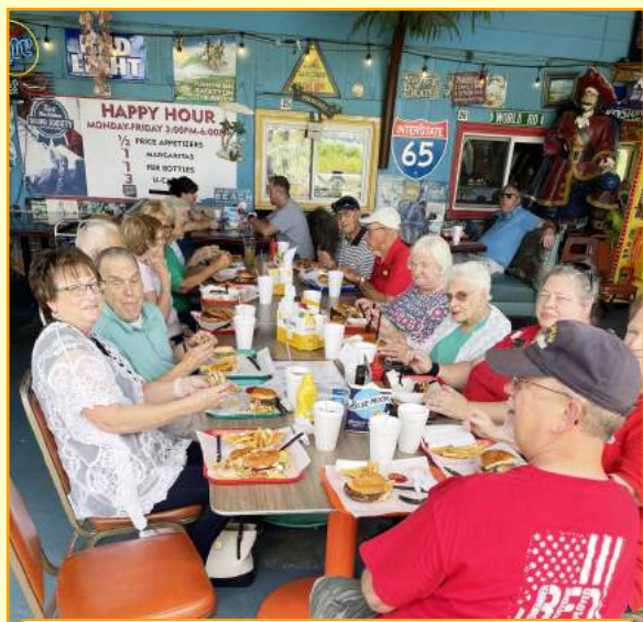
We enjoyed eating out at Burger Barge and the ROMEO's visited Avanti's!