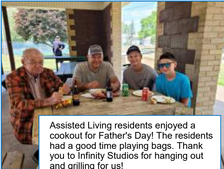
Assisted Living residents enjoyed a cookout for Father's Day! The residents had a good time playing bags. Thank you to Infinity Studios for hanging out and grilling for us!