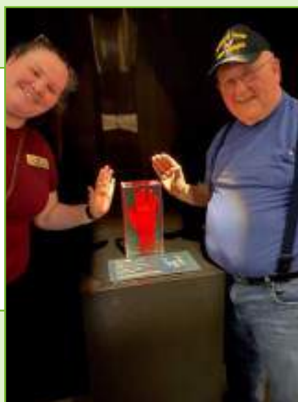
The Retirement Community residents had a great time visiting all the interesting exhibits at the Peoria Riverfront Museum!