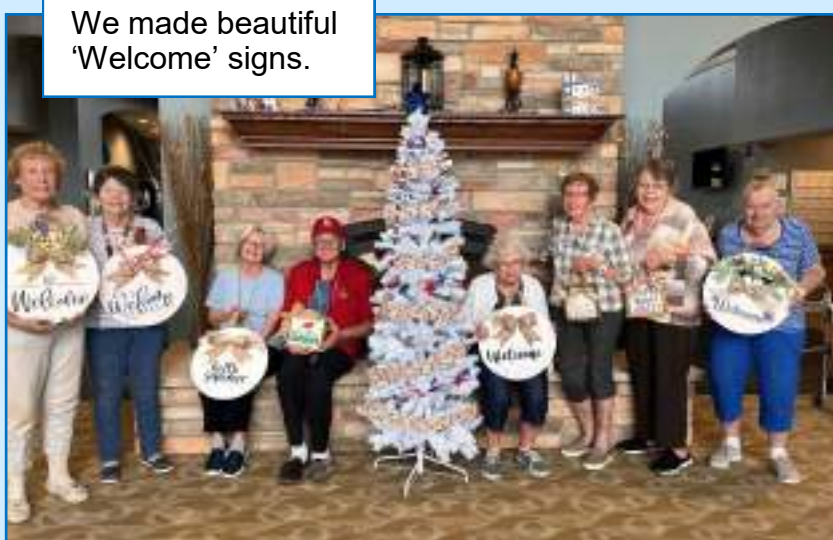
We made beautiful 'Welcome' signs.