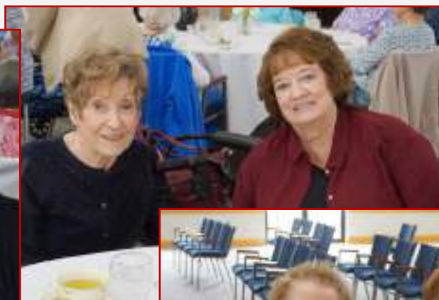
Friends and family joined residents for a Mother's Day Tea.