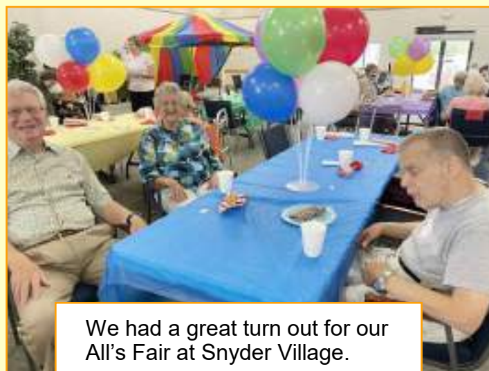
We had a great turn out for our All's Fair at Snyder Village.