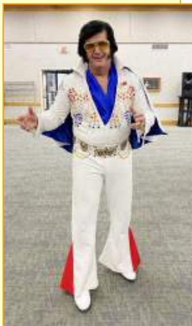
We had lots of fun during Elvis week with our Hound Dog Pool Party, learning to hula, and an Elvis Tribute Artist coming to sing for us.