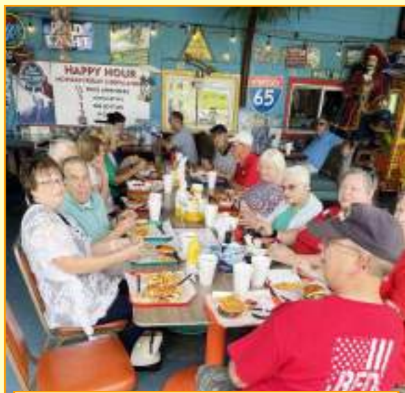
We enjoyed eating out at Burger Barge and the ROMEO's visited Avanti's!